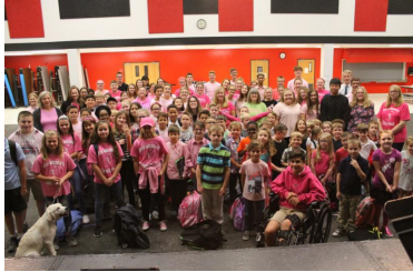
WCA for Pink Out Day