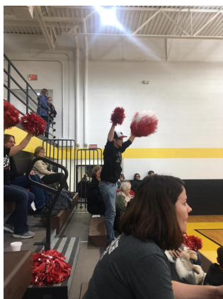
The WCA cheering section at Faith Baptist School, Davison MI Final Varsity Volleyball game - MACS Championships