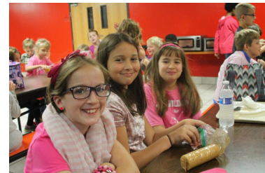
Students participate in Dig/Kick Pink Day 2018