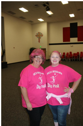
The Brendtke family is all in for Dig Pink!