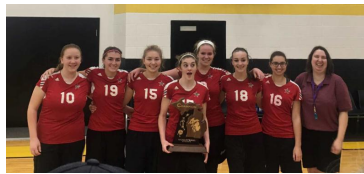
Our 2018 Girls Varsity Volleyball Team earn the MACS 1st Place! Congratulations, team!