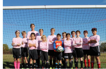
WCA Middle School Soccer Team is ready for Kick Pink 2018