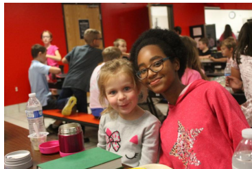
Students participate in Dig/Kick Pink Day 2018