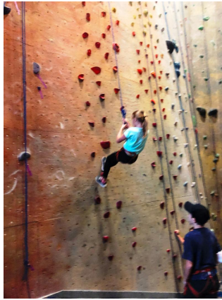
5th & 6th Graders have a field trip to Planet Rock to learn team building

2nd Grade explores the Botanical Gardens