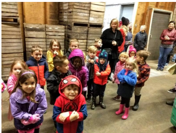
Preschool discovers how apples grow. Wasem's Apple Orchard