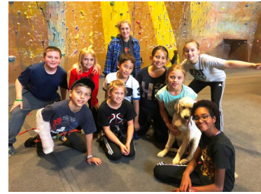
It was a great experience at Planet Rock!

Learning about plant life at the Botanical Gardens