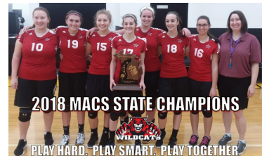
A history-making team- our 2018 Varsity Volleyball team brings home the MACS State Championship for the first time ever!