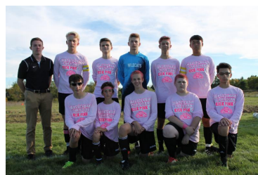
Varsity Soccer's Kick Pink Team