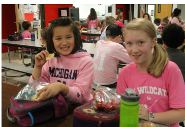
Students Pink-out our campus!