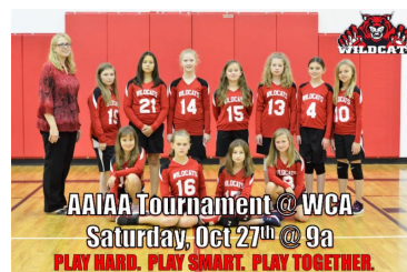
Our Middle School Girls Volleyball host a post-season tournament at WCA